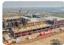
Matco Corn Division Faisalabad, Punjab